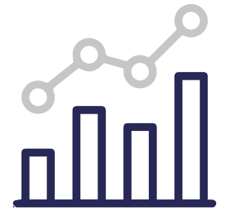
Building analytical capability and shared learning