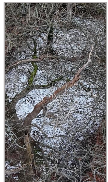
Figure 2 Deadwood in the canopy of a mature Oak tree, ready for removal.