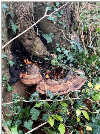
Figure 1 Ganoderma Australe growth on a Common Beech tree

The inspections have been carried out using several methods, the main being a visual inspection. Every tree has been examined from ground level for structural integrity, height, defects, hazards, vitality and how it is interacting with the surrounding environment. Each tree has then been scored based upon its condition followed by a note of recommendation on any requirements for remedial work. Did you know that there is a British standard for all tree work? BS3998:2010 (Tree work – recommendations) and this covers tree surveys!