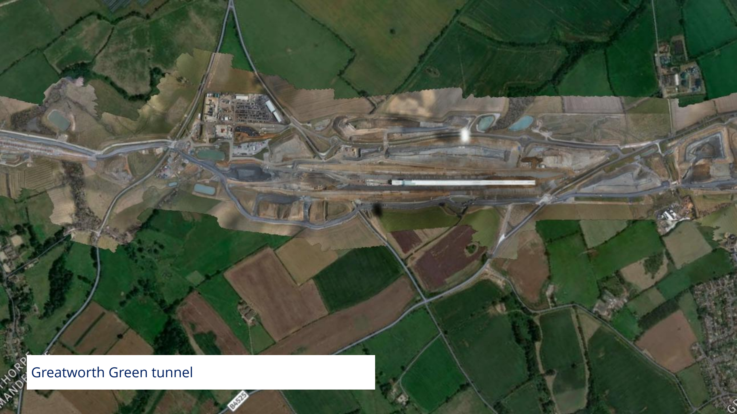
Greatworth Green tunnel